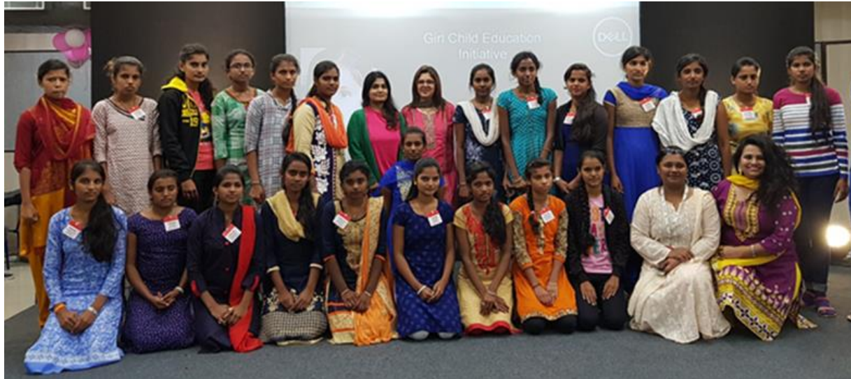
SGEP Annual Event 2018

Sikshana's Girl Empowerment Program (SGEP): The year 2018-19 also marked the 7 th Anniversary of SGEP. As we looked back we realized that the program has scaled up tremendously since its inception in 2012. It started with supporting 15 girls with scholarship back then, whereas in 2018-19 we supported 525 girls from socio-economically backward families.