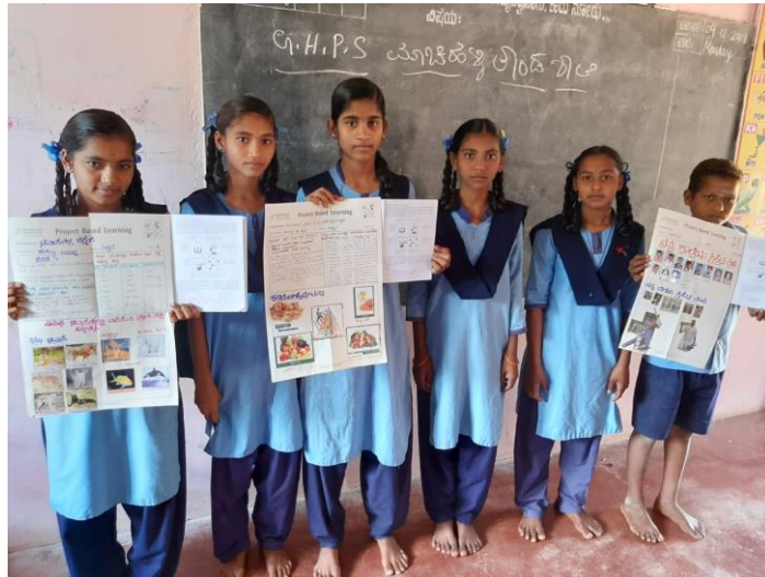
Students Presenting their Projects

The inspiration for conceptualizing PBL, came from a few schools where STEP was being implemented originally. Sikshana's operations team was quick to recognize an innovative story that was brewing in a couple of schools of Anekal block of Bangalore Urban District. In these schools the computer hardware stopped working in middle of the session and was sent for repair. The incident did not deter the students and they continued their project research and analysis using newspapers, magazines, library books & text books. They even presented their findings in a chart paper instead of a PowerPoint presentation.